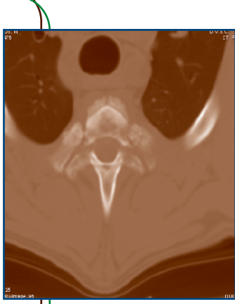
Lysis of the endplate, vertebral body, and costovertebral junctions.

Blood and urine cultures, brucella titer, and fungal titers were submitted. Jordan was treated with clavamox for presumed Staphylococcus discospondylitis. Clavamox was continued for 12 weeks. Within 2 weeks of beginning treatment, Jordan's pain was improved.